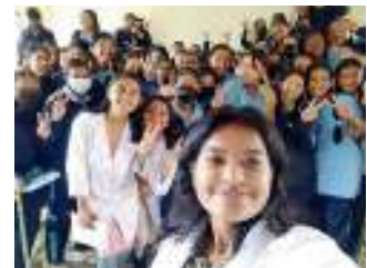
Female on Field "Menstruation Awareness Project"