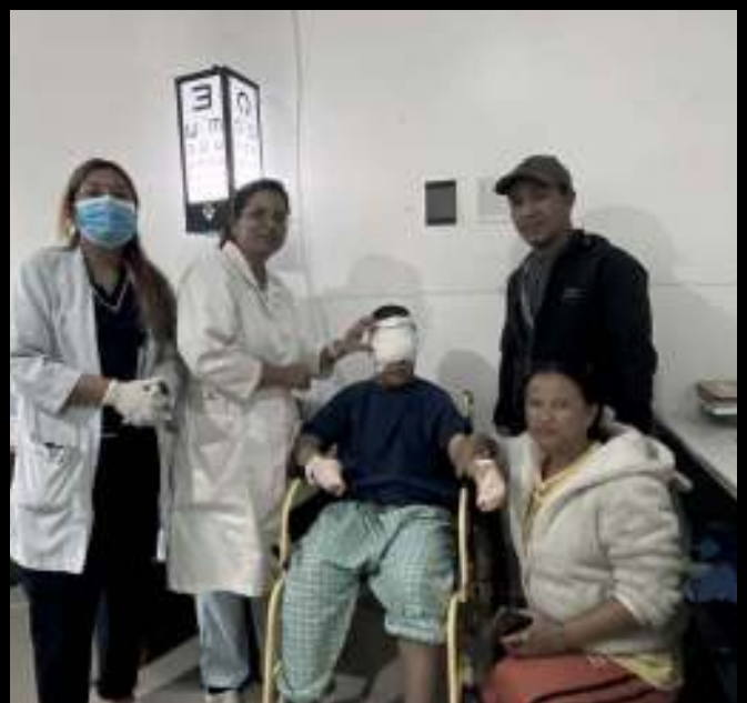
Hom with doctors and family. The Next day after operation