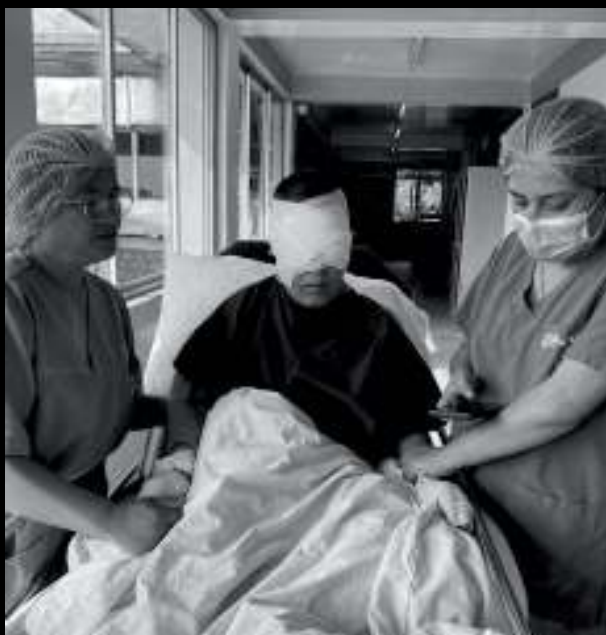
Bilateral SICS was done under GA on 10th April 2023.