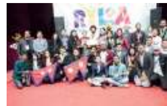
Representing Nepal at Rotary Youth Leadership Awards, Manali India