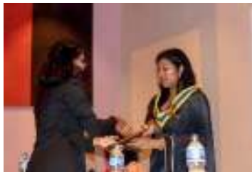
Sergeant-at-arms handing gong and gavel to president