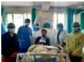
Project Sahara contributing the treatment expenses for a patient