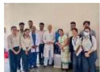
RAC KUMS installed the drinking water jar at KUSMS Library