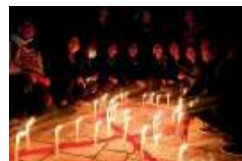
Celebrating AIDS day in Dhulikhel Hospital premises