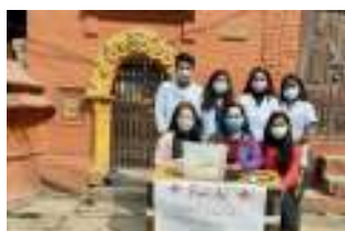
First Aid Project at Dhulikhel