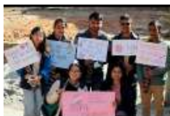
Antimicrobial Resistance Awareness Rally at Dhulikhel