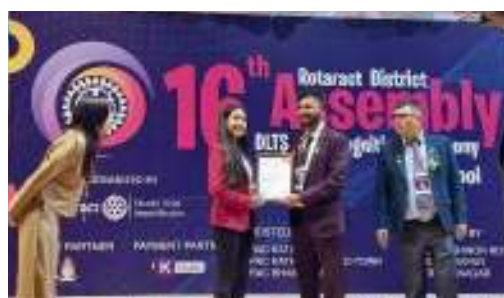
Platinum Citation award