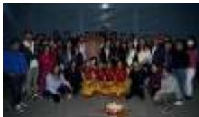
Deusi Bhailo Program A fund raising event for Sahara