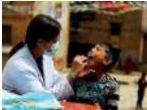
Oral Health Screening program at Dhulikhel