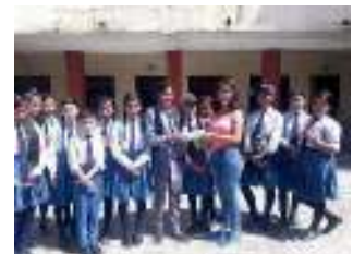
Providing sanitary kits to school kids